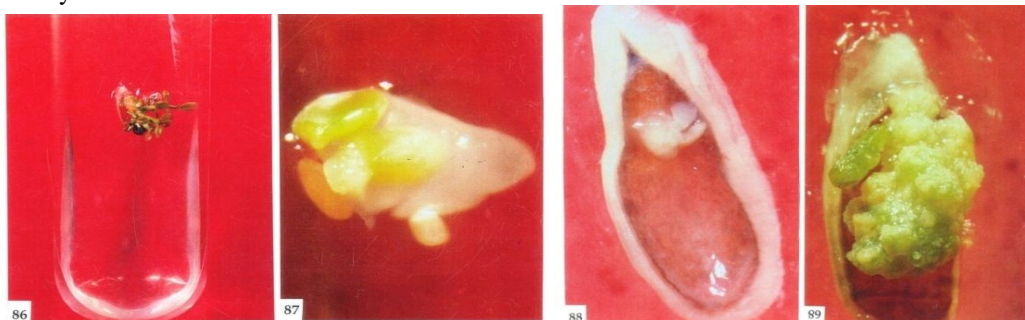
Figs. 86-89: Cultures of Citrus limonia

Fig. 84-85: Formation of individual nucellar embryos from halves of ovules taken from fruits of older than of desirable maturity