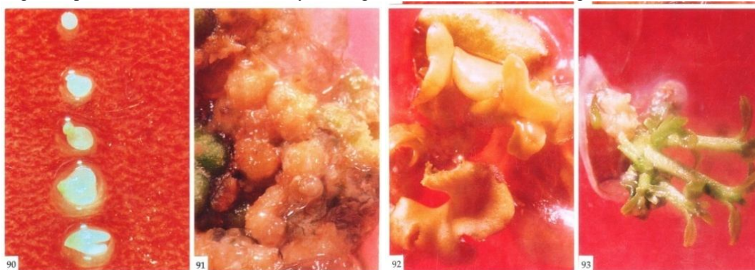
Figs. 90-93: Cultures of Citrus limonia

Fig. 88-89: Multiplication of nucellar embryos at the micropylar end of an ovular half with desirable nucellar maturity (Fig. 88); proliferation of nucellar embryos along with the nucellar tissue (Fig. 89)